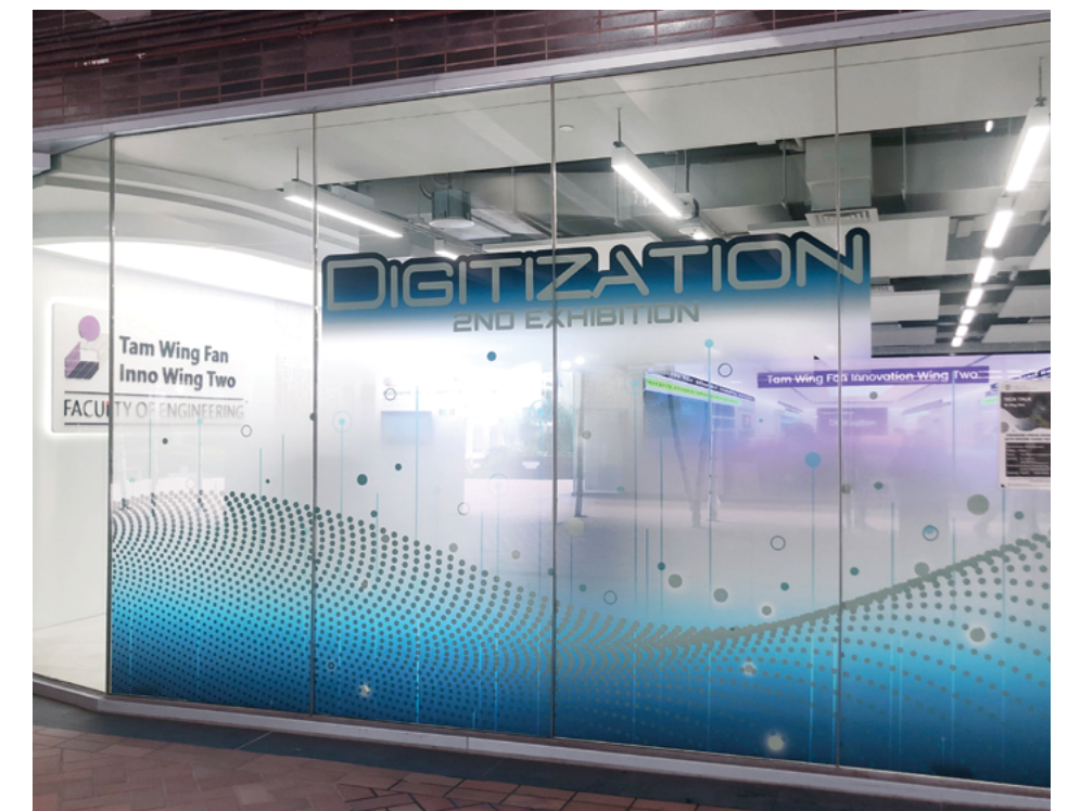
The Tam Wing Fan Innovation Wing Two was officially opened in December 2021. The Innovation Wing One and Two and the Innovation Academy together form an integrated hub for innovation, exploration, outreach and collaboration.

Wing, which opened in phases in late 2020 and late 2021, supports maker culture through a well-equipped space where students can collaborate, develop their ideas, and receive training from experts and peers. So far more than 2,300 students from all 10 faculties have come through the Innovation Wing.