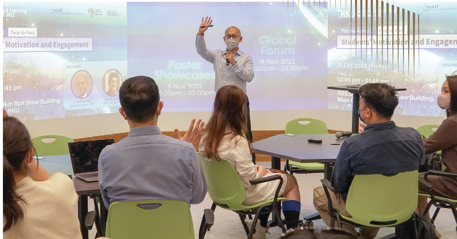
The 3rd HKU Teaching and Learning Festival 2022 celebrated the achievements of teaching innovation and development that positively impact student learning.

Resilience and forward-thinking marked the University's teaching and learning in the 2021-22 academic year, when we made progress in advancing and modernising our curriculum while coping efficiently with the ongoing challenges posed by COVID-19. Our guide has been the HKU Undergraduate Teaching and Learning Strategy 2021-28, which lays out a framework for innovating teaching and maximising students' potential.